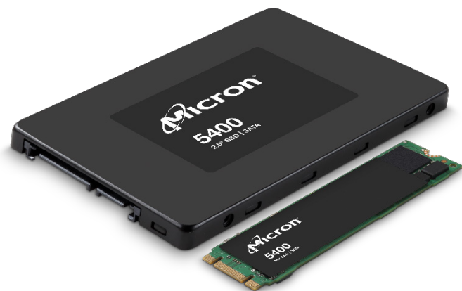
Micron 5400 SSD

Additional firmware-based security options like TCG Enterprise and TCG Opal combine with integrated, hardware-based AES 256-bit encryption for full performance plus extra security and peace of mind. 5