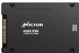
Micron 6500 ION 30.72TB SSD Available in U.3 (15mm) and E1.L (9.5mm)

For data centers that need to affordably scale storage density, the Micron 6500 ION is the answer.