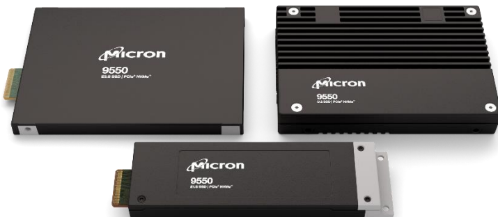
Micron 9550 NVMe SSD

Micron IP and components are fully vertically integrated with Micron-designed controller ASIC, 232-layer NAND, DRAM, firmware, and validation.