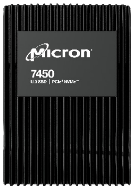
U.3: 7mm and 15mm

Designed as a mainstream solution, the 7450 SSD balances performance and density. Our offering includes a PCIe Gen4, M.2, 22 x 80mm with power-loss protection 4 and a 7.68TB E1.S that delivers industry-leading capacity. 5